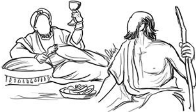
The rich man and Lazarus